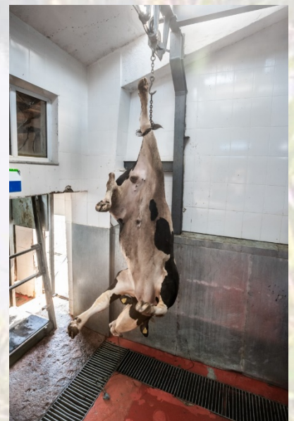
As this cow hangs to bleed out, the next cow is lined up.

Horrifyingly, these guns don't always make their mark. Some cows continue, fully conscious, terrified, and in torturous