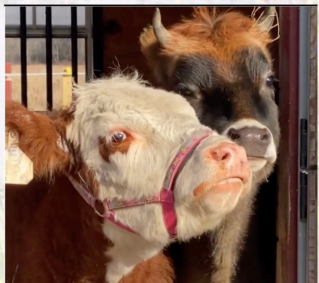
The moment Harold arrived, new brother Dexter took him under his wing. Harold welcomed the calming affection.

You've probably seen newspaper articles in which a cow escapes slaughter, runs away, and everyone roots for him or her to be granted their freedom. Why? What makes us think these cows deserve to live more than the ones stuck too far back in a transport truck to escape? We all love a feel-good ending like Harold's. Together, we can make every cow's story have the same ending. Every time you take a step toward eliminating beef from your diet, you are helping to change the world for cows just like these buddies.